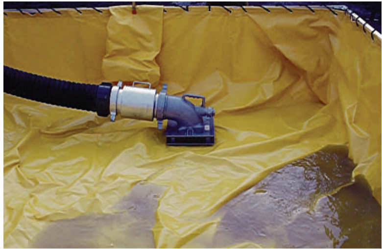
6" attached to 6" low level strainer